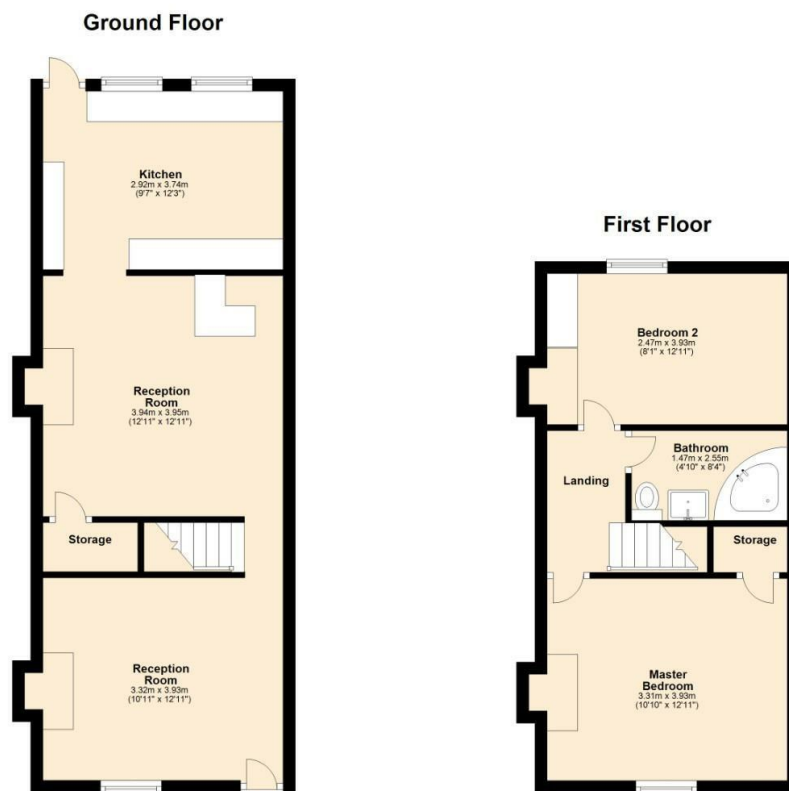
Partridge Hill Street, Padiham