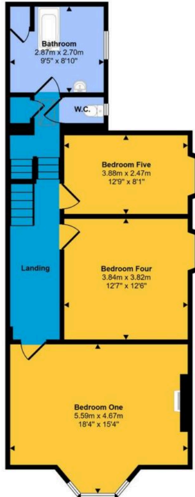
First Floor Approx 72 sq m / 772 sq ft