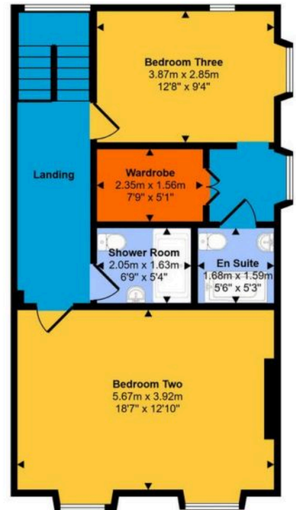
Second Floor Approx 60 sq m / 647 sq ft

This floorplan is only for illustrative purposes and is not to scale. Measurements of rooms, doors, windows, and any items are approximate and no responsibility is taken for any error, omission or mis-statement. Icons of items such as bathroom suites are representations only and may not look like the real items. Made with Made Snappy 360.