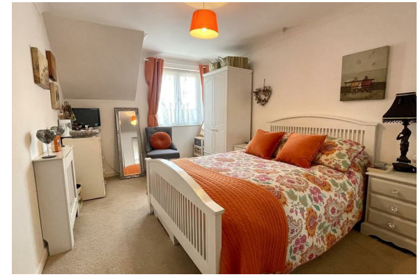
MORE @ HTTPS://WWW.LOVETTINTERNATIONAL.COM