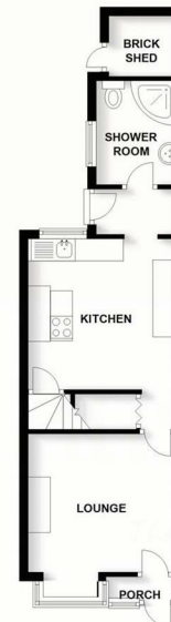
GROUND FLOOR APPROX. 34.8 SQ. METRES (374.4 SQ. FEET)