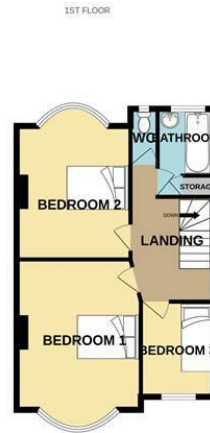
3 BED SEMI

Whilst every attempt has been made to ensure the accuracy of the floorplan contained here, measurements of floors, windows, rooms and any other items are approximate and no responsibility is taken for any error, omission or mis-statement. This plan is for illustrative purposes only and should be used as such by any prospective purchaser. The services, systems and appliances shown have not been tested and no guarantee as to their operability or efficiency can be given. Made with Metropix ©2024