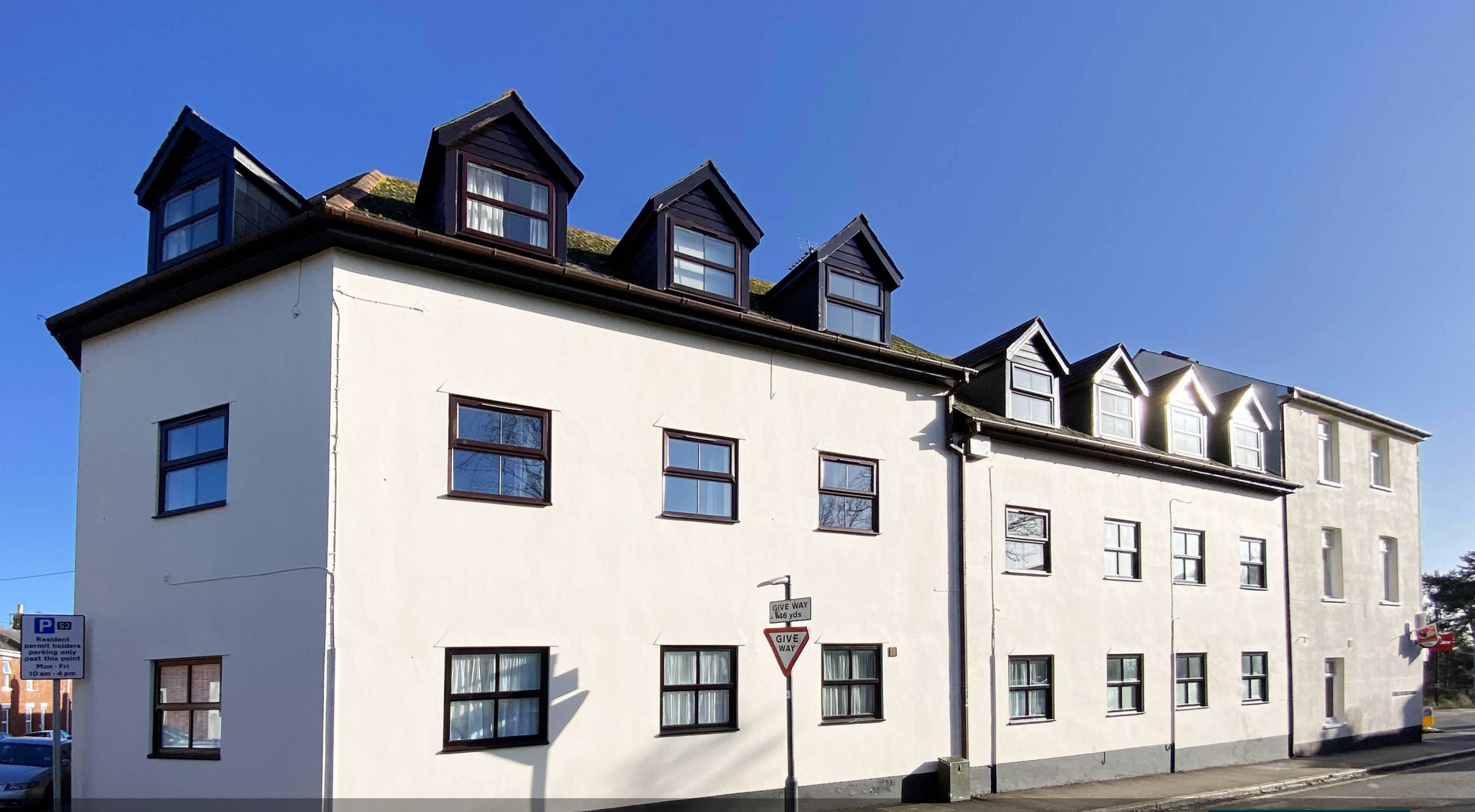
Shaul House, Heavitree Exeter - £150,000