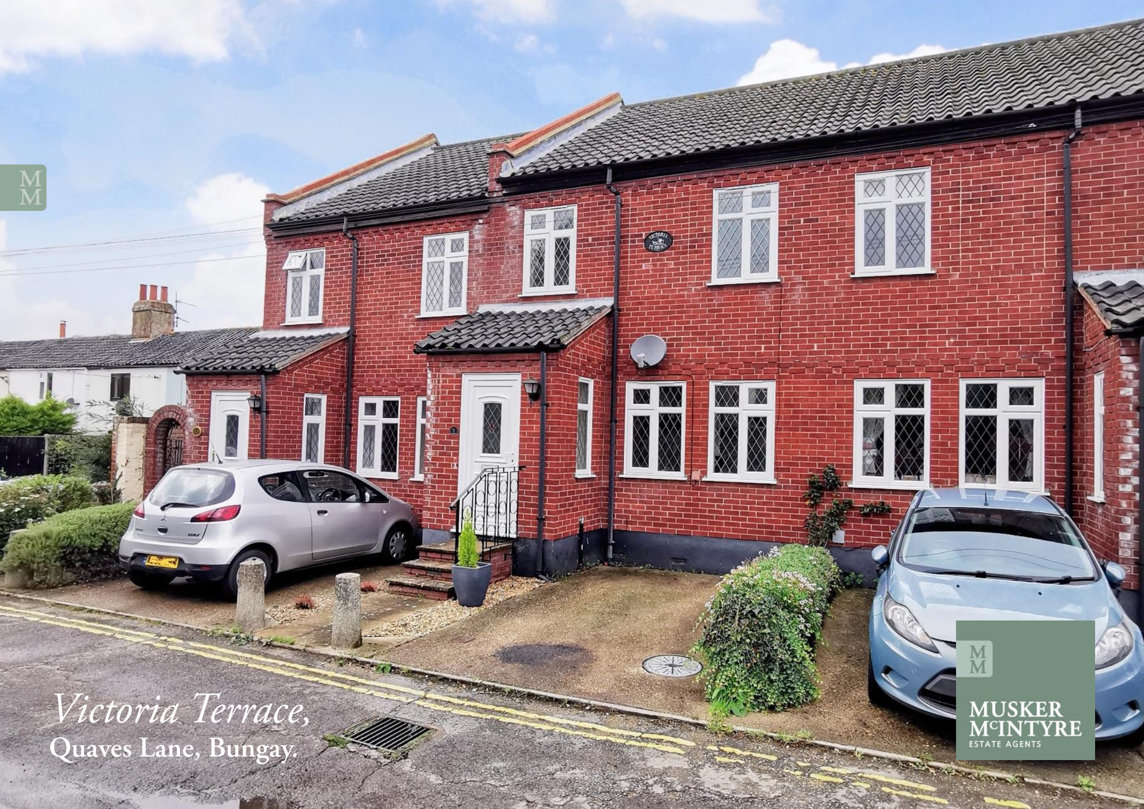
Victoria Terrace, Quaves Lane, Bungay.