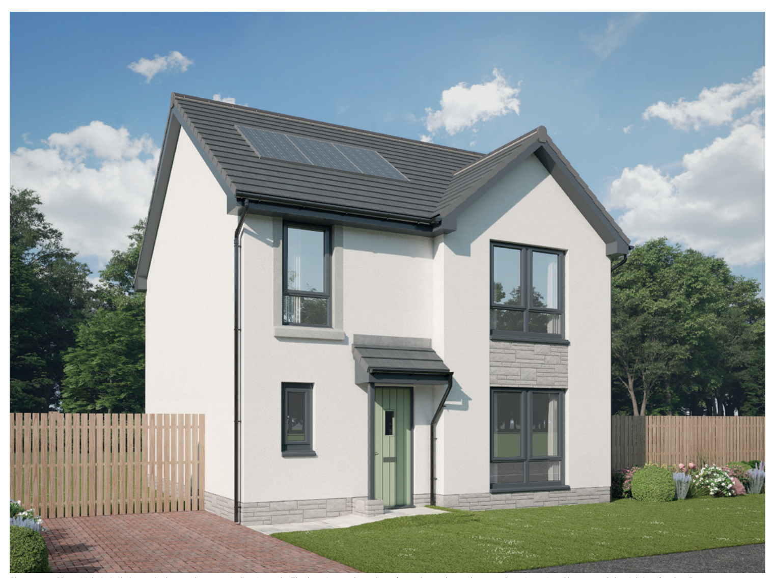
Please note Photo Voltaic (solar) panels shown above are indicative only. The location and number of panels are dependent on plot orientation. Please see Sales Advisor for details.