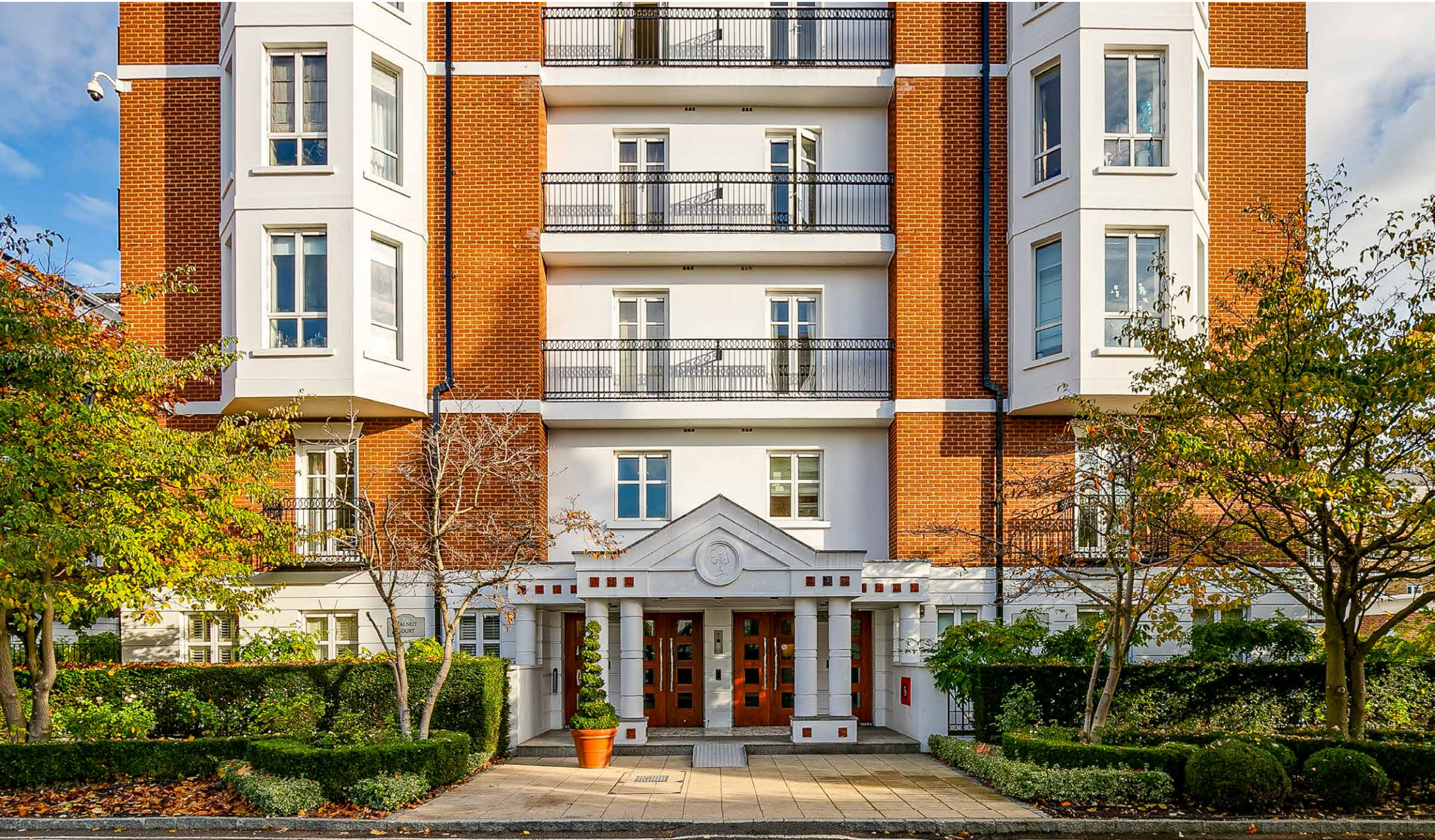
Walnut Court Kensington Green, W8