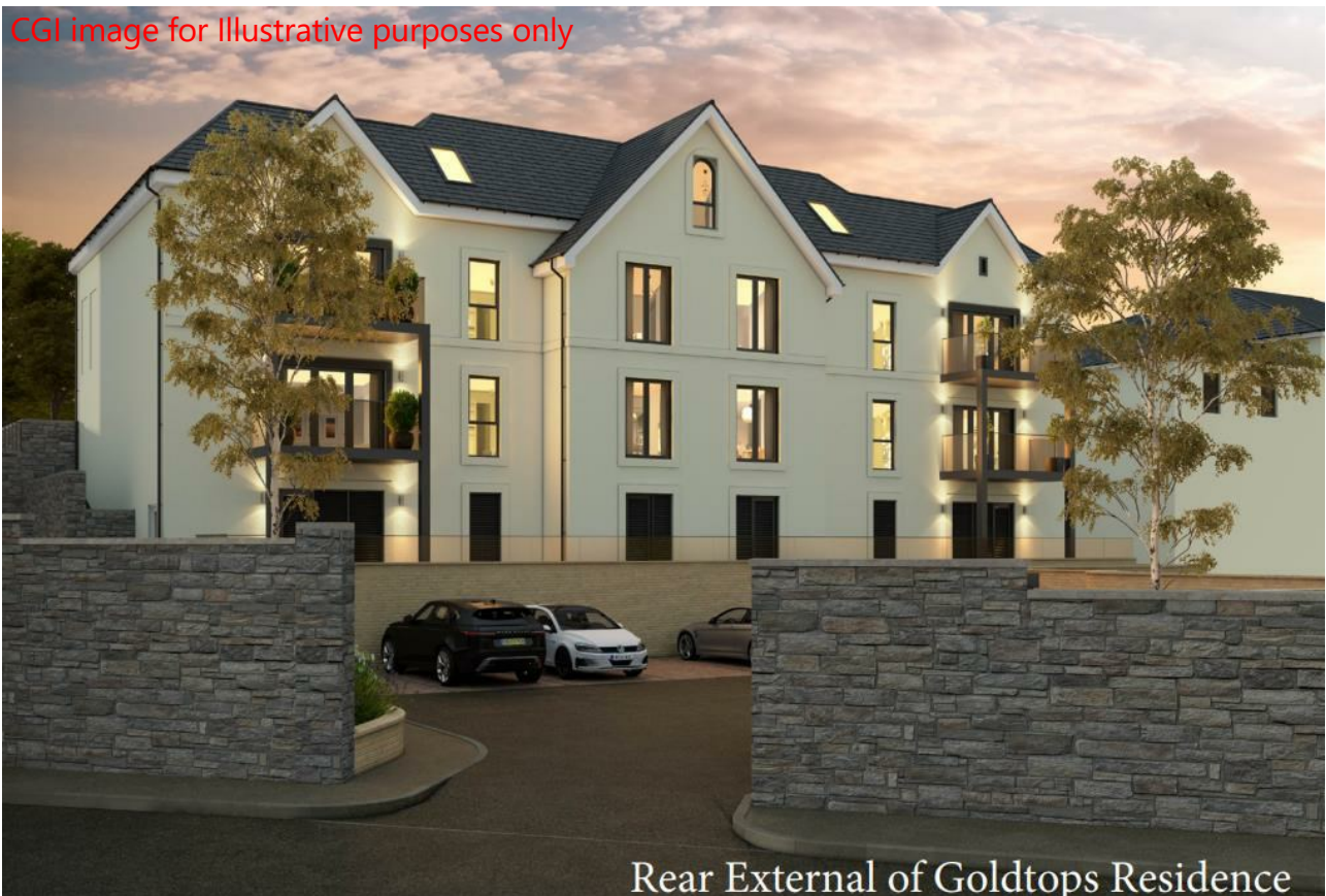
Rear External of Goldtops Residence

IMPORTANT NOTICE – Commercial List for themselves and the Vendors or Lessors of this property whose agents they are given notice that: