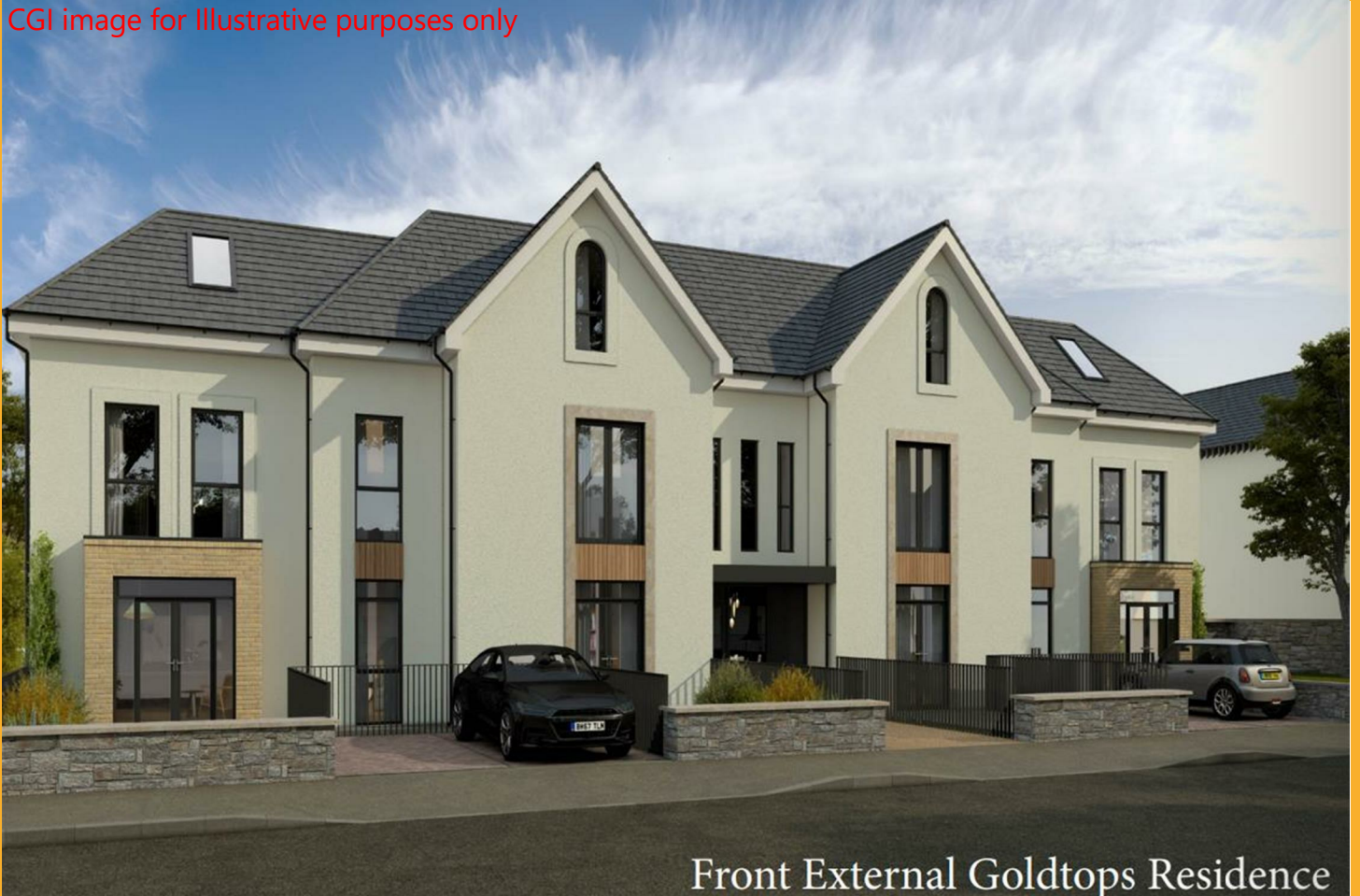
Front External Goldtops Residence

CGI image for illustrative purposes only