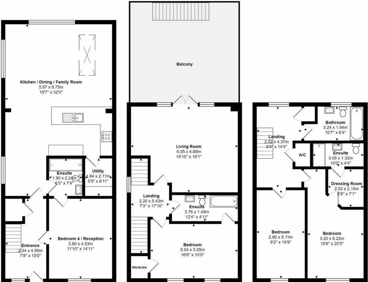
Total Area: 208.1 m 2 ... 2240 ft 2 All measurements are approximate and for display purposes only

These particulars, whilst believed to be accurate are set out as a general outline only for guidance and do not constitute any part of an offer or contract. Intending purchasers should not rely on them as statements of representation of fact, but must satisfy themselves by inspection or otherwise as to their accuracy. No person in this firms employment has the authority to make or give any representation or warranty in respect of the property.