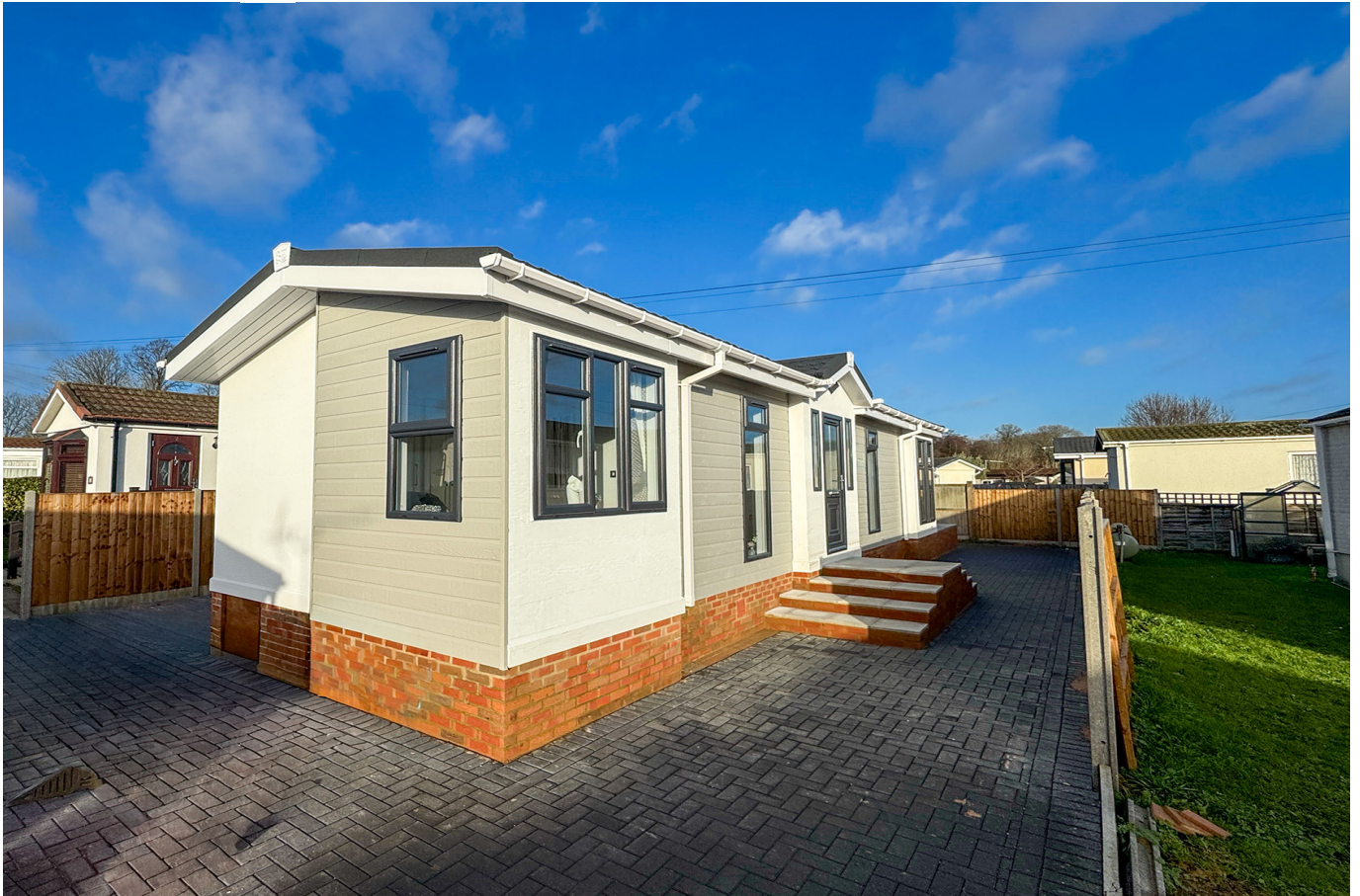
3 Kay Avenue Weybridge Park Estate Addlestone Surrey KT15 2RF