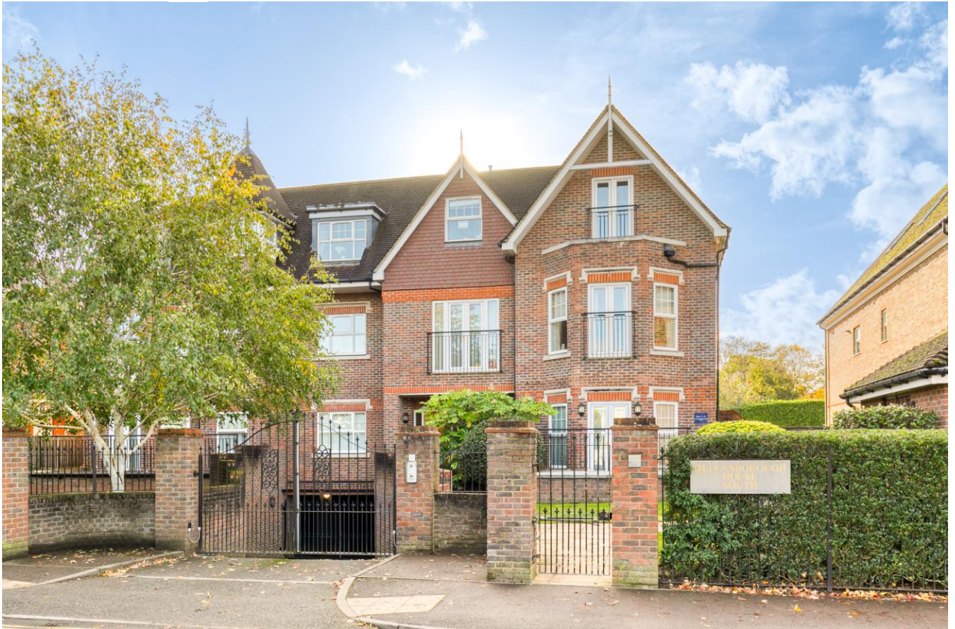
8 Queensborough House South Oatlands Chase Weybridge Surrey KT13 9SF