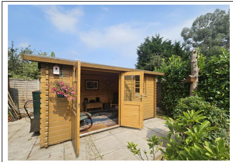
Cabin ideal for relaxing and entertaining in