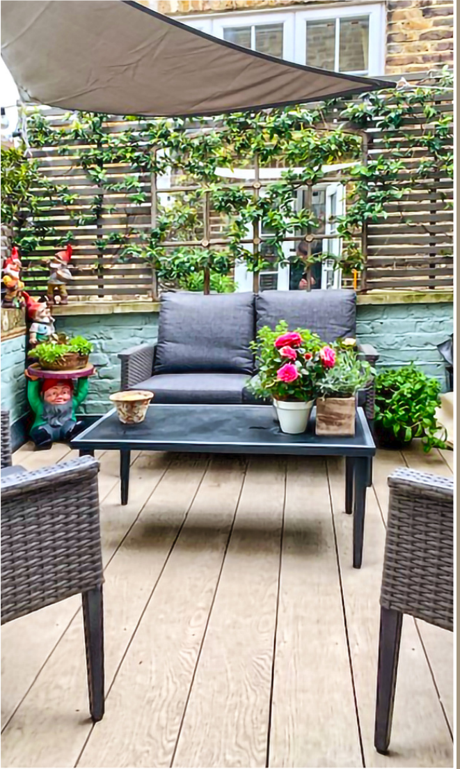
period house in a wonderful Notting Hill location, entered on the very charming Bridstow Place. The property has undergone a full refurbishment by the current owner and is presented in excellent condition.