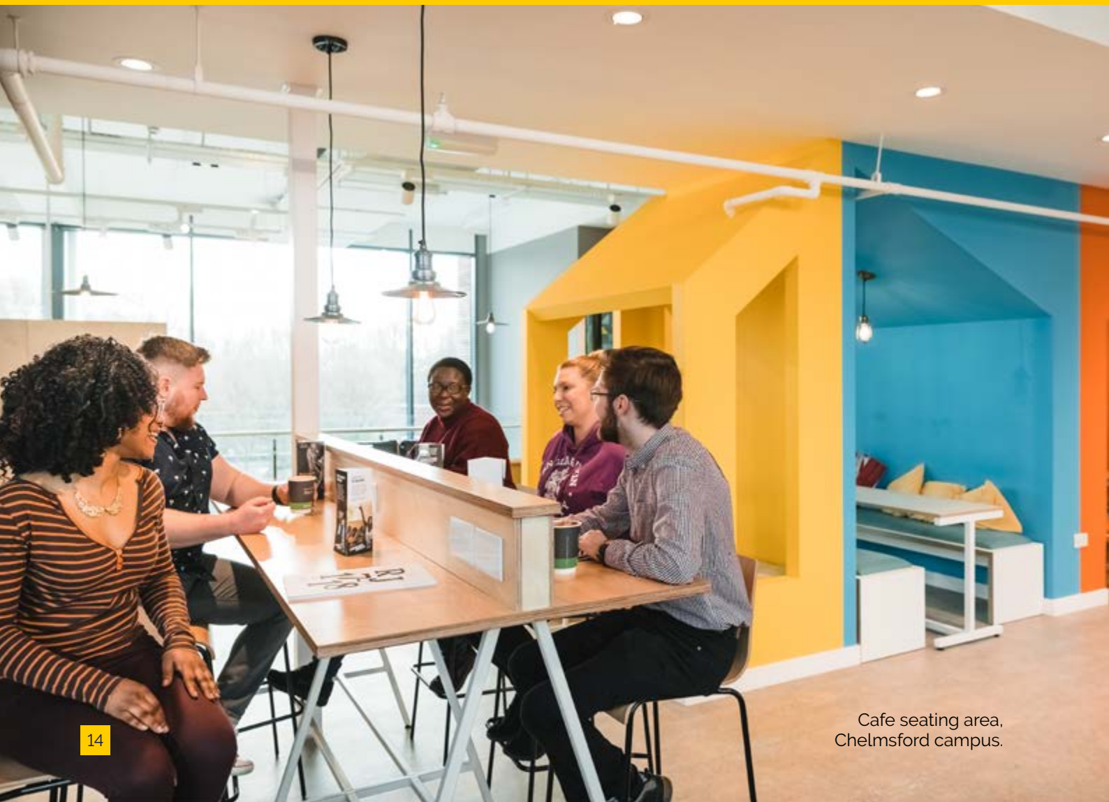
Cafe seating area, Chelmsford campus.

If you don't want to move into one of our physical office spaces, a virtual membership connects you with our entrepreneurial ecosystem from anywhere in the world.