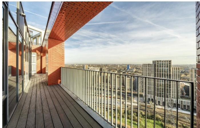
City Island Way, E14