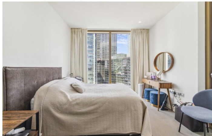
Park Drive, E14