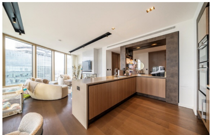
Park Drive, E14