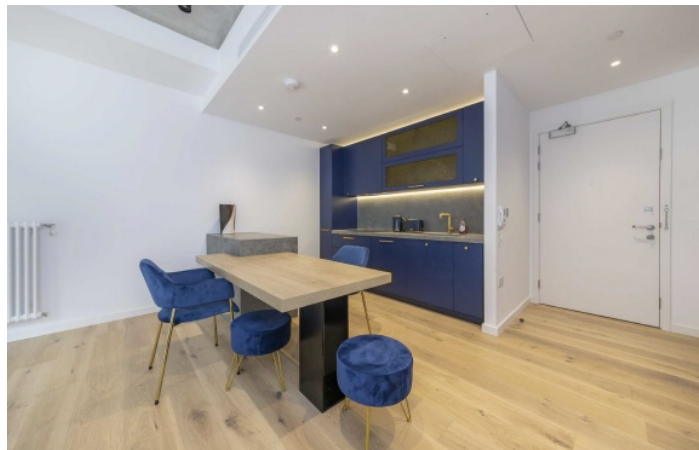
Orchard Place, E14