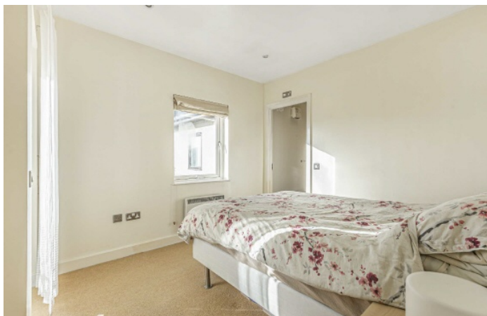
Raleana Road, E14