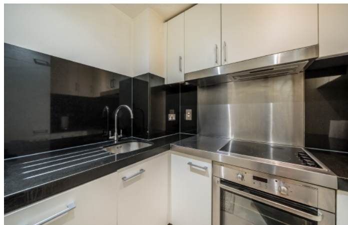
Fairmont Avenue, E14