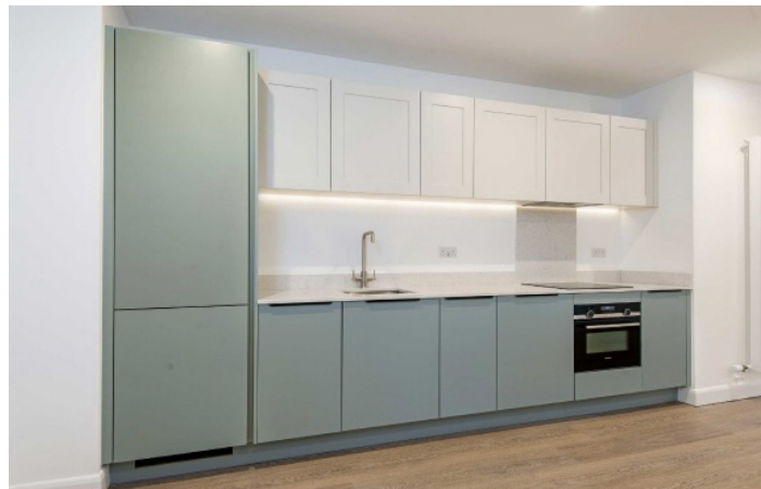
Western Gateway, E16