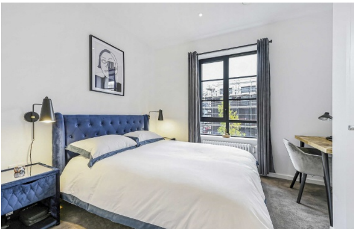
Orchard Place, E14