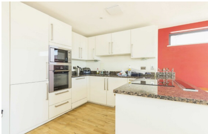
Chrisp Street, E14