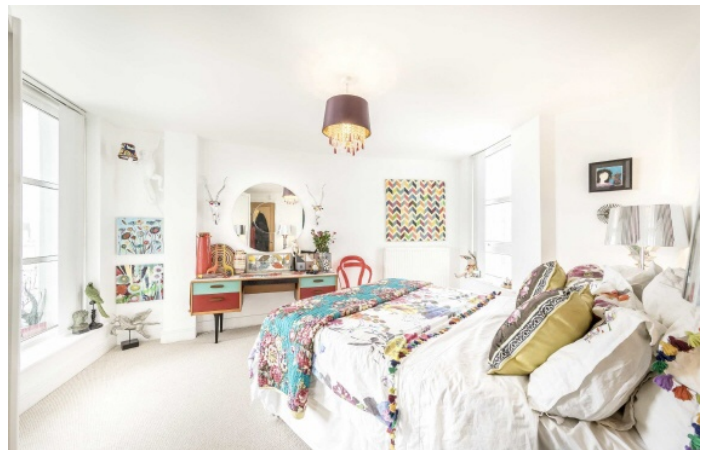
Barrier Point Road, E16