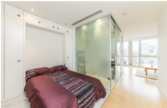
Fairmont Avenue, E14