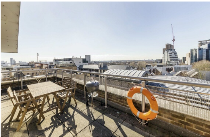
Meridian Place, E14