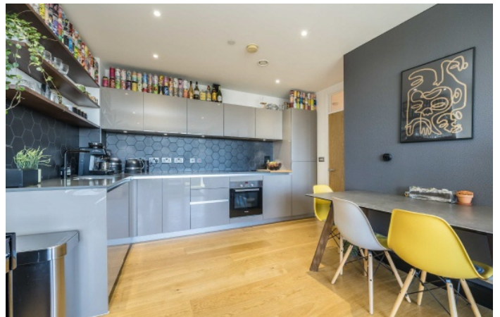
Barry Blandford Way, E3