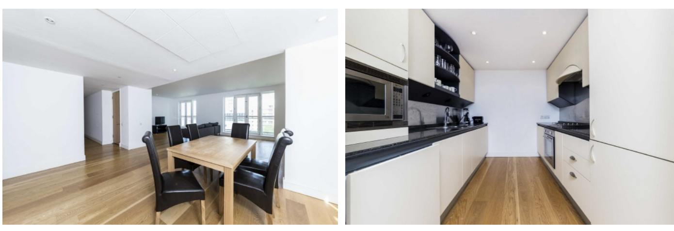
Westferry Circus, E14