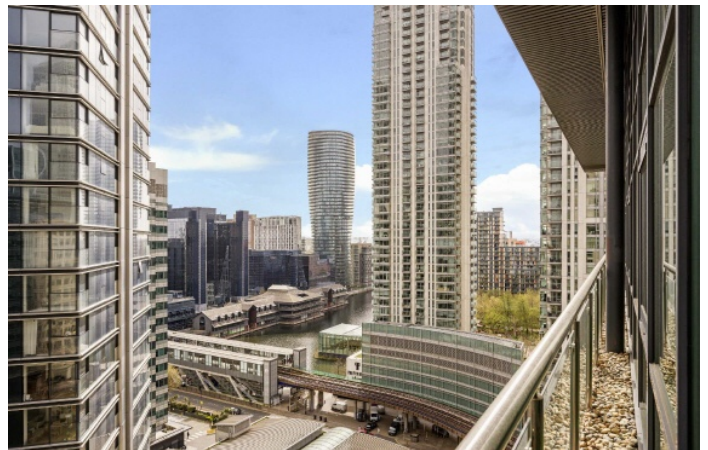
South Quay Square, E14