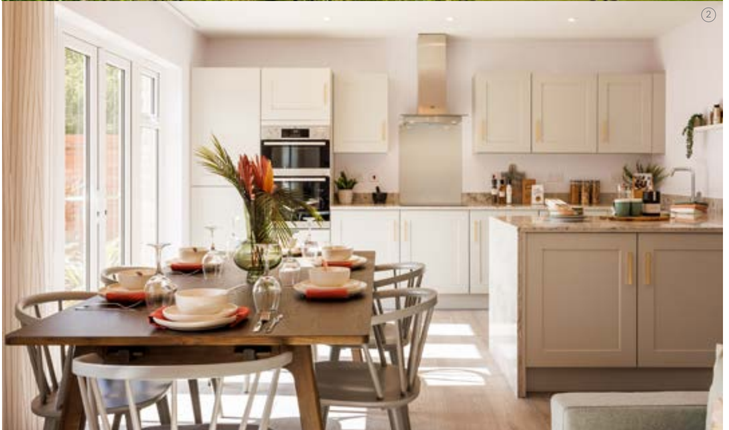
① ↳ Streetscene at Poppy Fields, South Midlands ② ↳ Typical kitchen interior