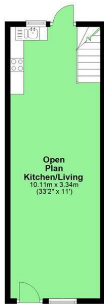
Ground Floor Approx. 33.8 sq. metres (363.8 sq. feet)