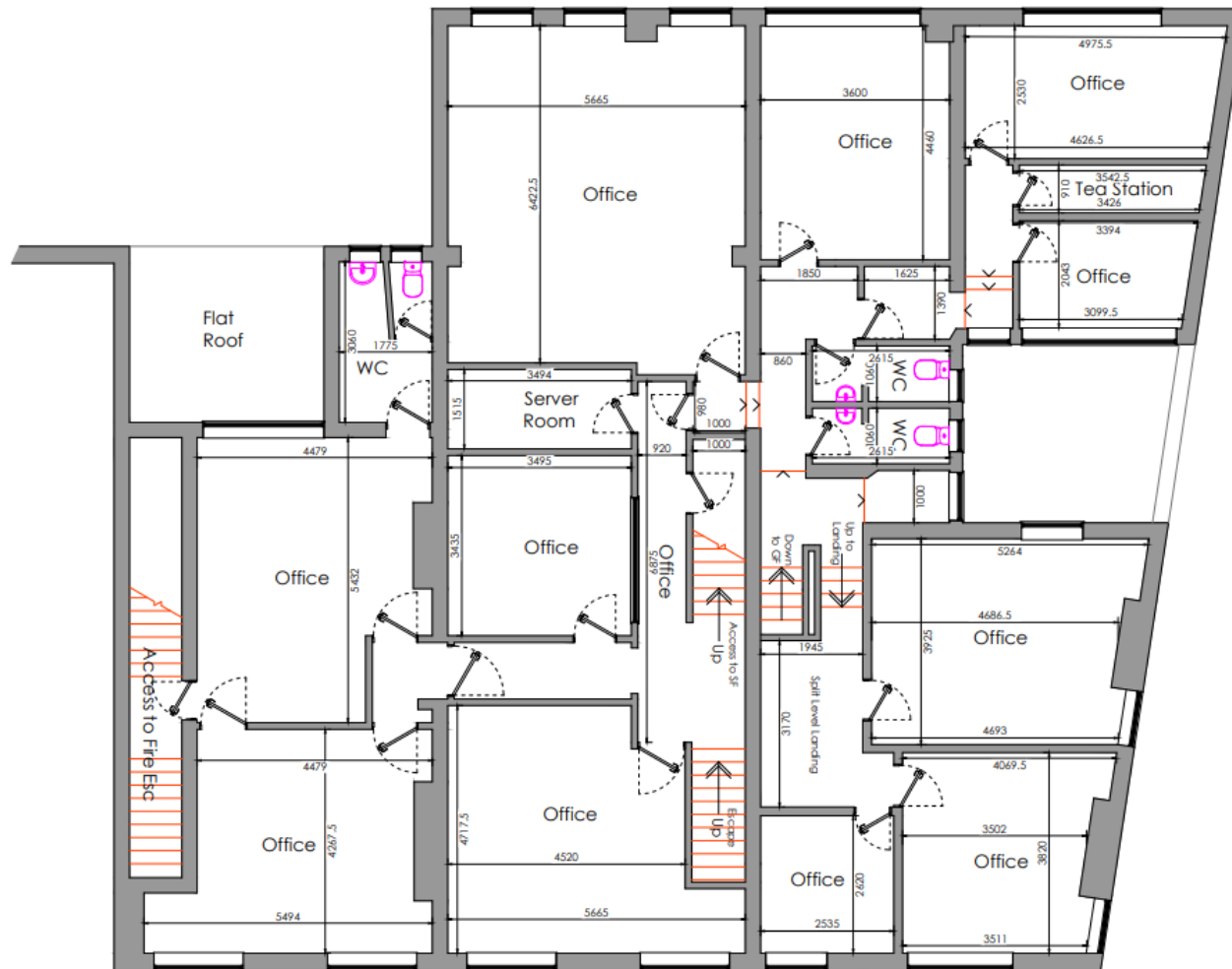
Existing First Floor Plan

18 St Cuthberts Way Darlington, County Durham DL1 1GB Telephone: 01325 466945