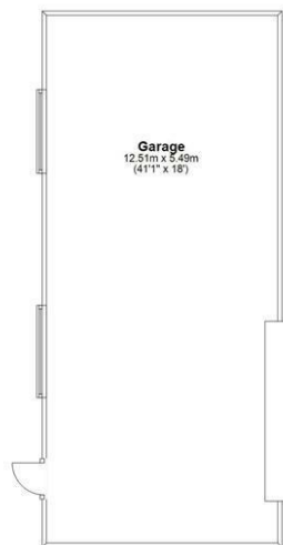
Ground Floor Approx. 59.9 sq. metres (644.8 sq. feet)

Local Authority - East Cambs Districct Council