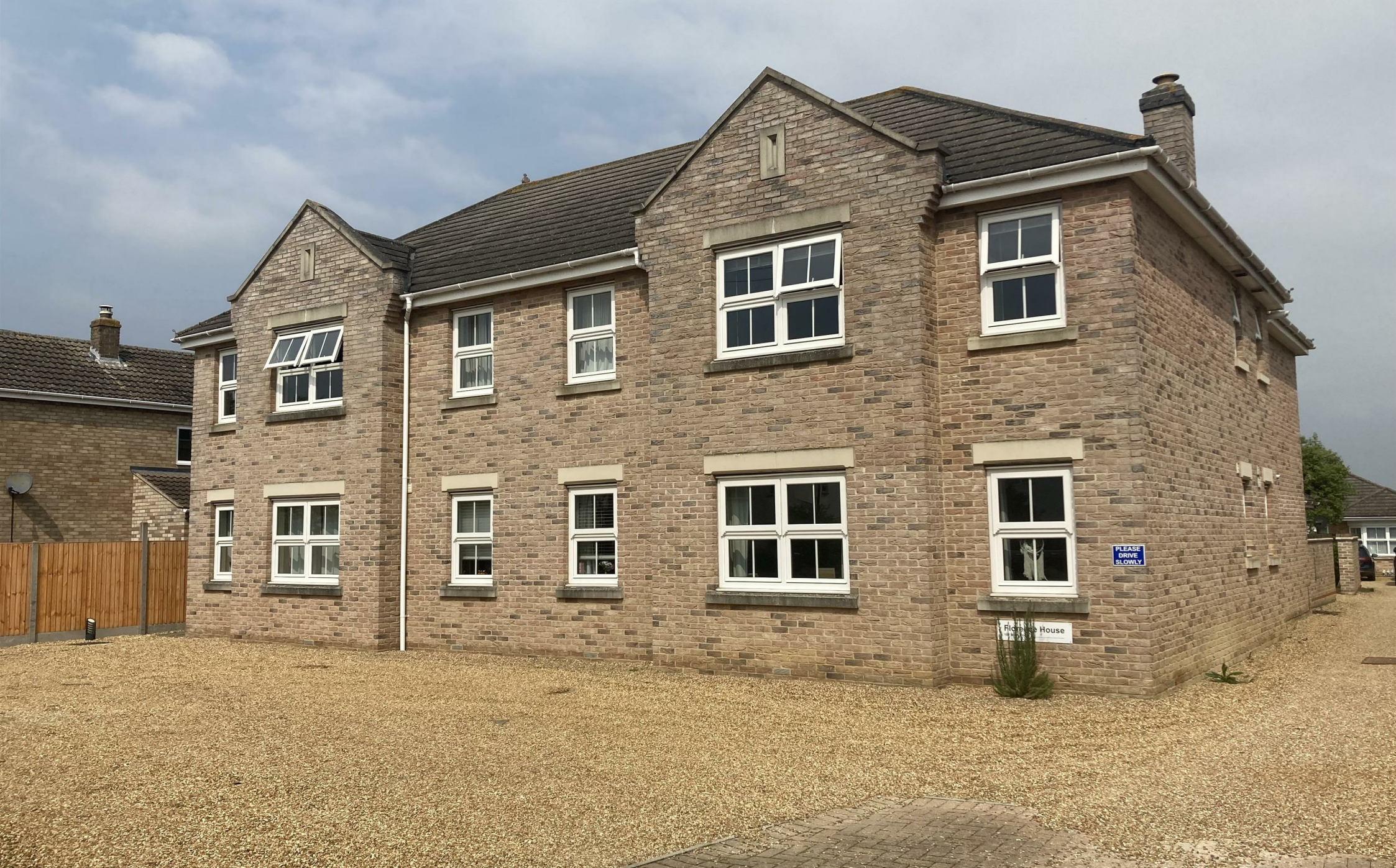
Florence House 162 Main Street, Witchford, CB6 2HP