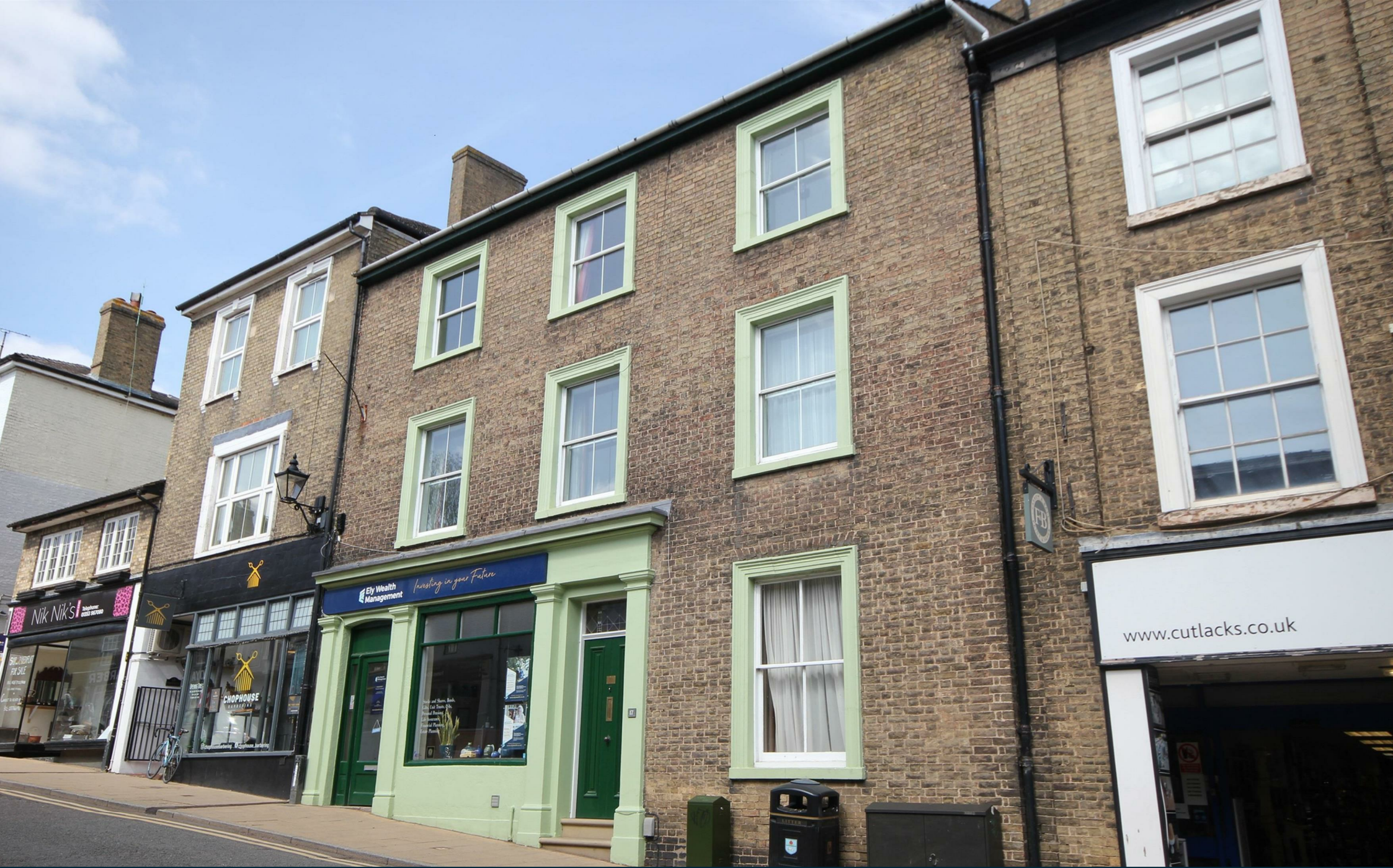
Mulberry House, Forehill, Ely, CB7 4AA