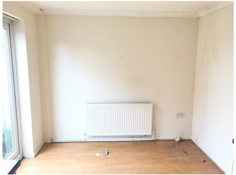
Neutral decor and radiator with a set of stylish French doors opening out on to the patio area