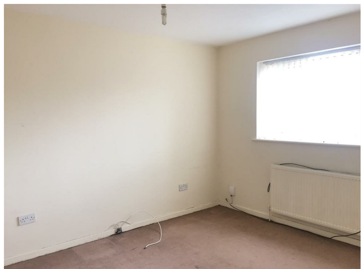
Double room with a front aspect of the property with carpets and neutral paintwork and radiator