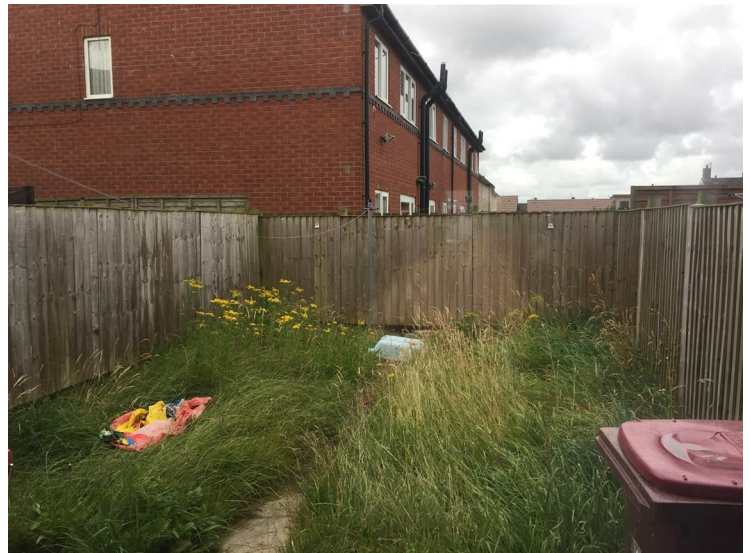
Garden laid to lawn with a flagged patio area