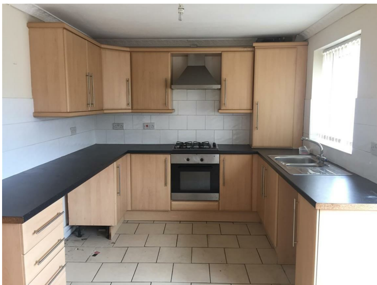
Fully fitted kitchen with built in oven hob and extractor fan