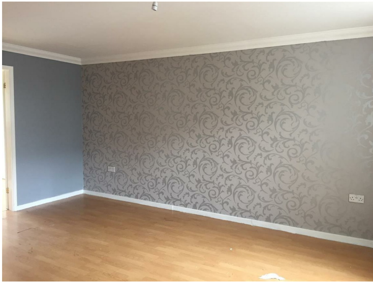
Karndean flooring neutral decor with at urge wall and radiator