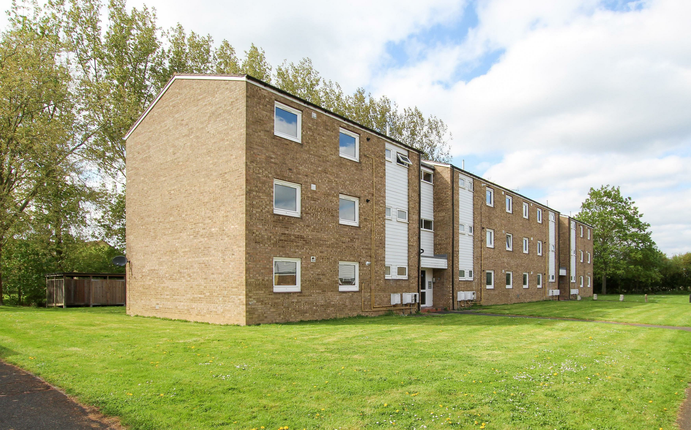
Abbey Court, Waterbeach, Cambridge, CB25 9PT