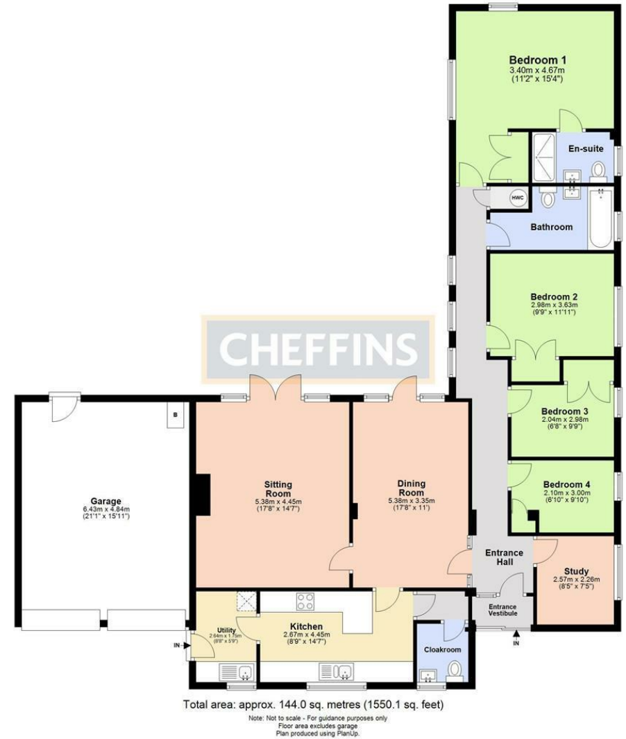
Ground Floor Approx. 144.0 sq. metres (1550.1 sq. feet)