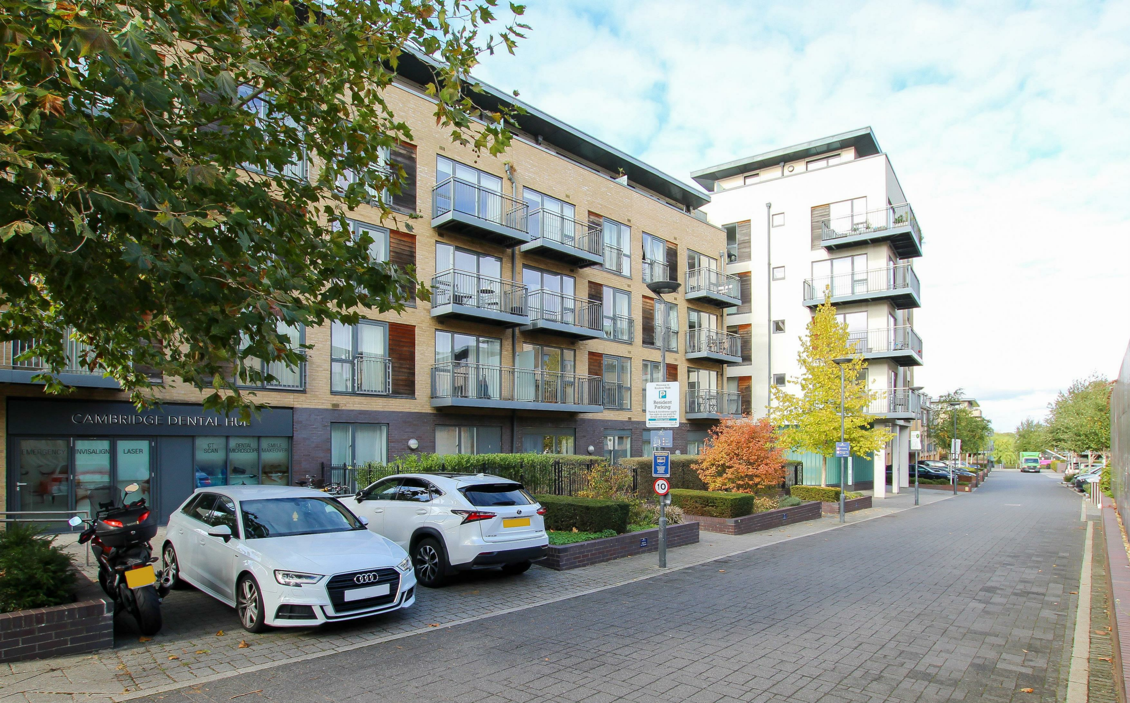
Brooke House, Kingsley Walk, Cambridge, CB5 8TJ