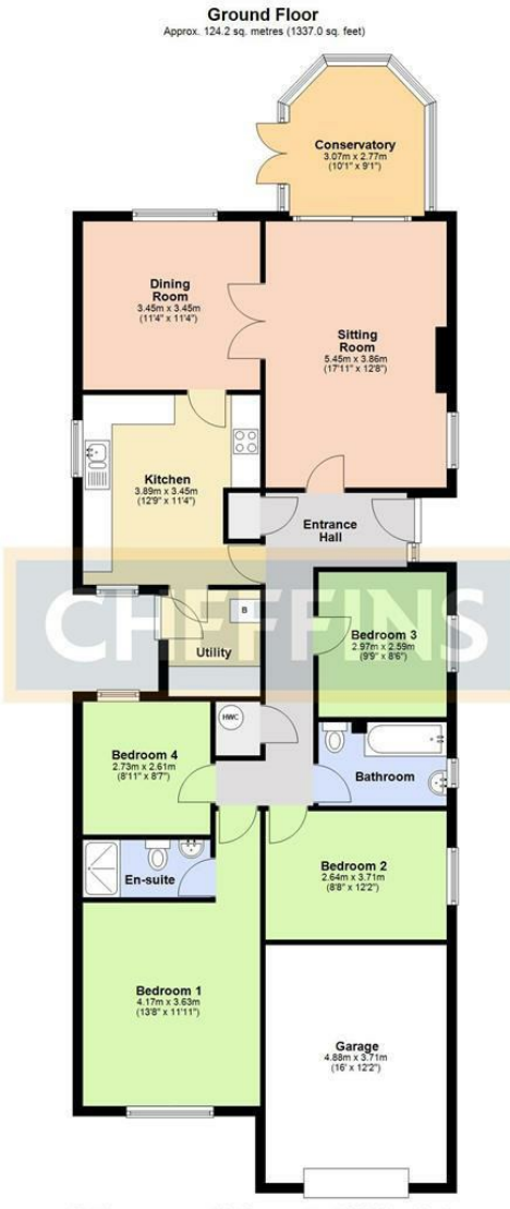
Total area: approx. 124.2 sq. metres (1337.0 sq. feet) Floor area excludes the garage Plan produced using PlanUp.