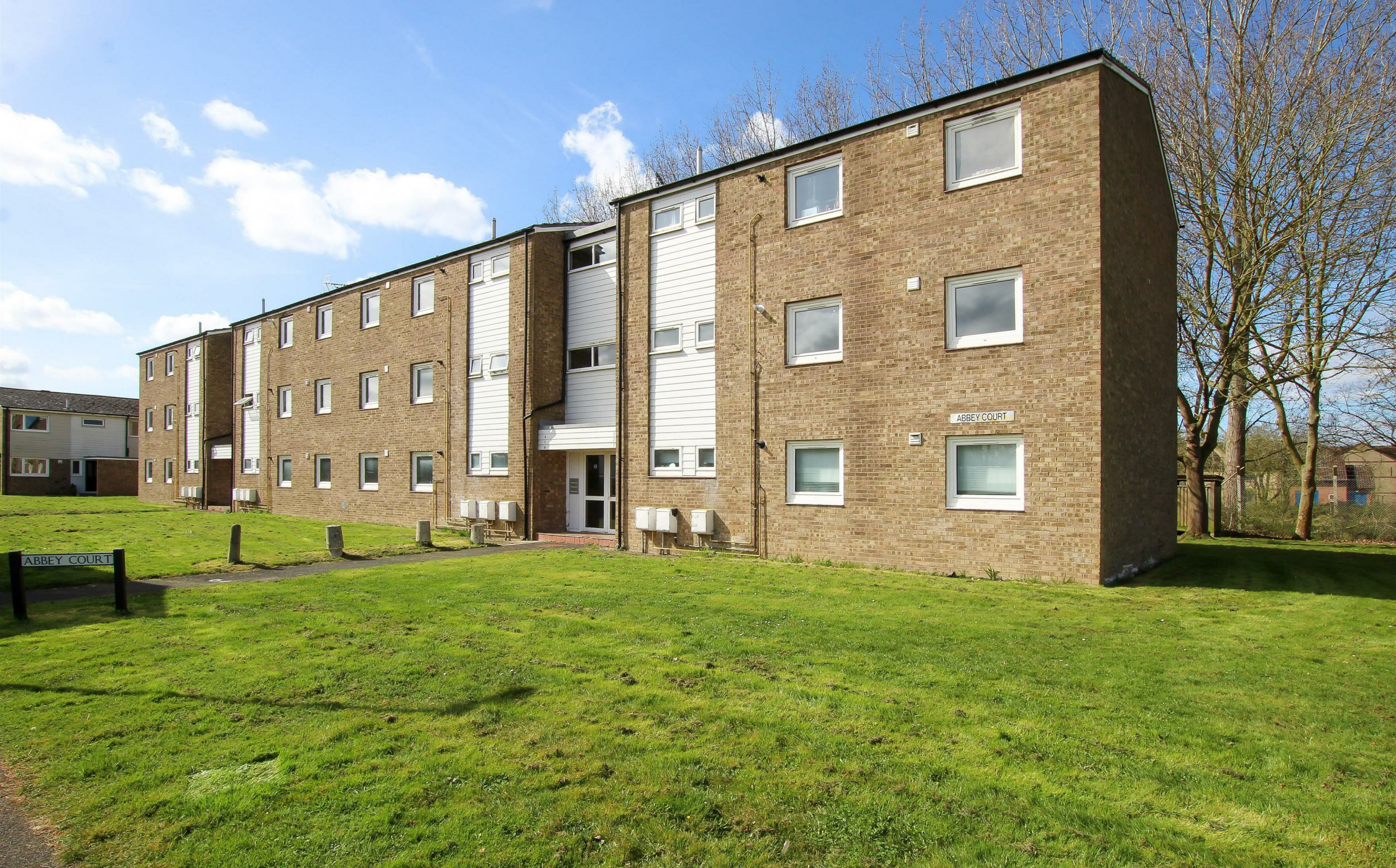
Abbey Court, Waterbeach, CB25 9PT