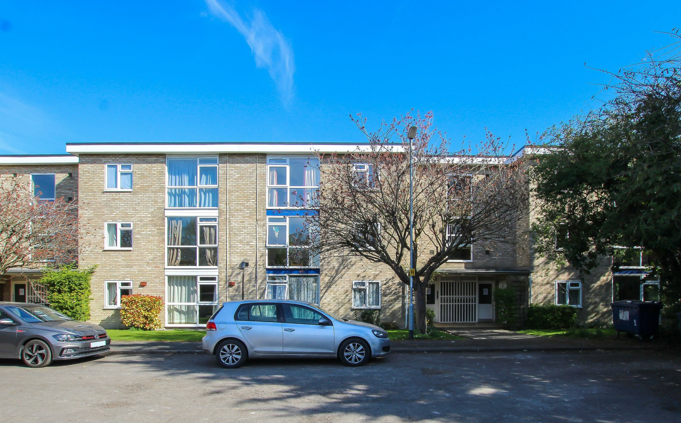
Lilac Court, Cambridge, CB1 7AY