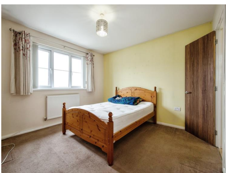
15' 1" x 11' 4" ( 4.60m \times 3.45m ) Window to rear

Artificial grass and decorative stone chip areas.