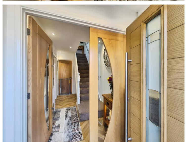
About The Property