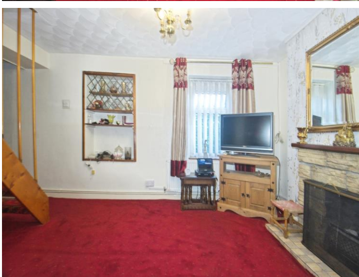
About The Property