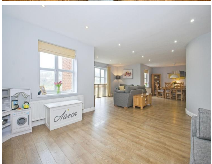
About The Property

This immaculate five-bedroom detached house in a highly sought-after location offers spacious and luxurious living with two reception rooms, a modern open-plan living/dining/kitchen area, a dressing room, and a dedicated study, making it an ideal family home.