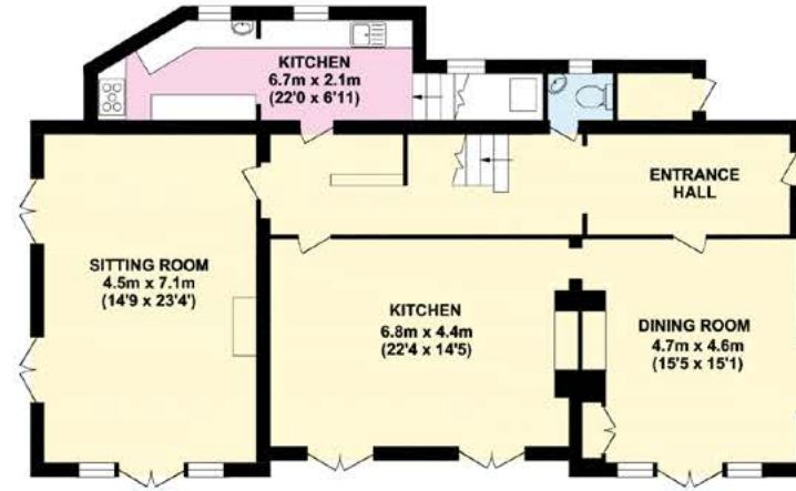
GROUND FLOOR APPROX. FLOOR AREA 134.2 SQ.M. (1445 SQ.FT.)