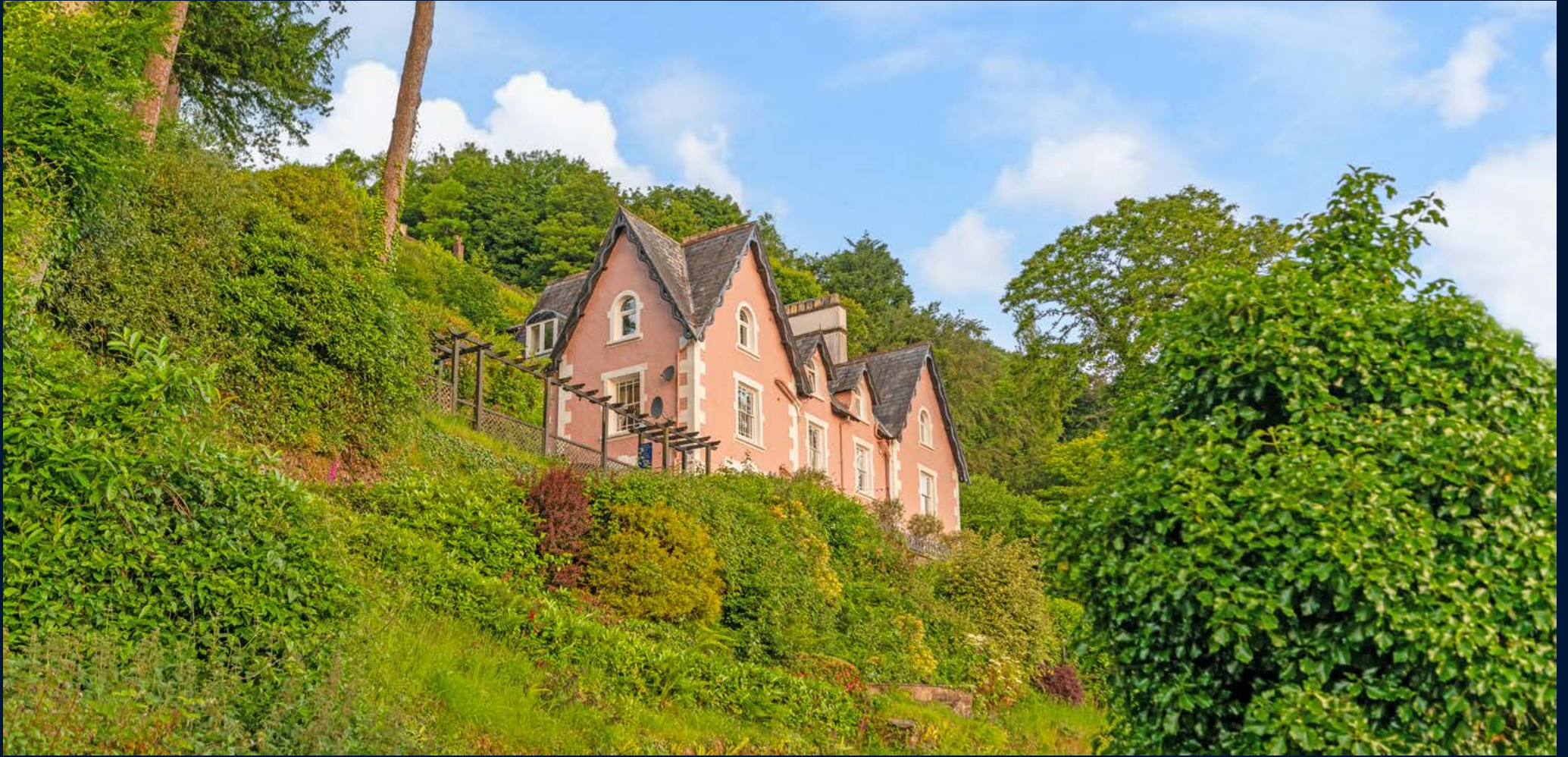
Seawood House, North Walk, Lynton, Devon, EX35 6HJ