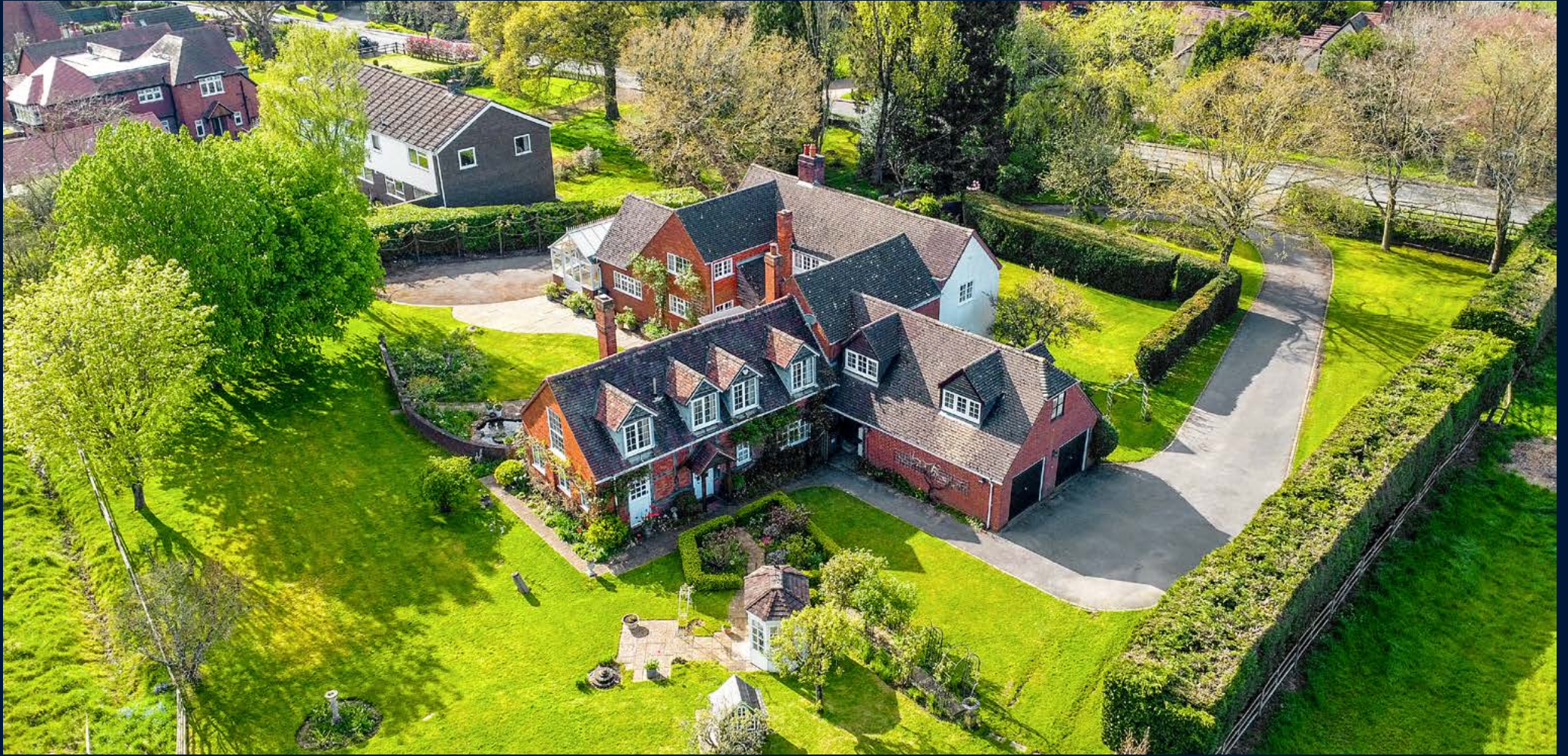
Little Beaumonts, Broad Lane, Tanworth-in-Arden, B94 5DP